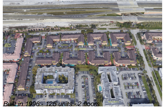
Built in 1996 - 125 units - 2 floors