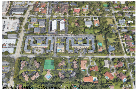
Built in 1968 - 128 units - 3 floors