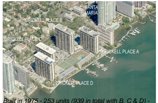
Built in 1975 - 253 units (939 in total with B, C & D) - 23 floors