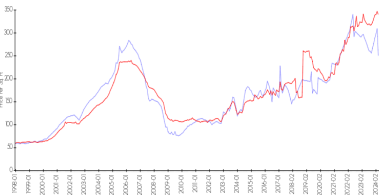
Jockey Club 1 vs North Miami Beach