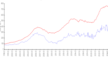
Arlen House East vs Sunny Isles