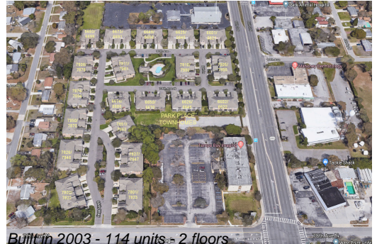
Built in 2003 - 114 units - 2 floors

Number of units: 114 Number of active listings for rent: 0 Number of active listings for sale: 1 Building inventory for sale: 0% Number of sales over the last 12 months: 2 Number of sales over the last 6 months: 0 Number of sales over the last 3 months: 0