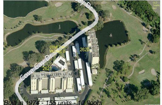
Built in 1974 - 155 units - 10 floors