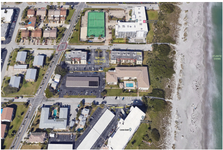
Built in 1985 - 30 units - 3 floors