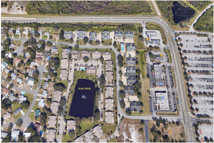
Built in 1987 - 48 units - 1 floor