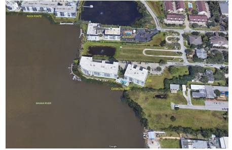
Built in 1994 - 44 units - 5 floors

Number of units: 44 Number of active listings for rent: 0 Number of active listings for sale: 2 Building inventory for sale: 4% Number of sales over the last 12 months: 1 Number of sales over the last 6 months: 0 Number of sales over the last 3 months: 0 Diamond Bay Condo Association 190 Pinellas LN #511A Cocoa Beach, FL 32931 https://www.diamondbaycocoa beach.com/