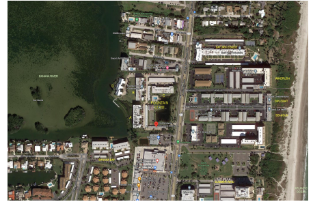
Built in 1985 - 114 units - 5 floors

Number of units: 114 Number of active listings for rent: 3 Number of active listings for sale: 3 Building inventory for sale: 2% Number of sales over the last 12 months: 2 Number of sales over the last 6 months: 1 Number of sales over the last 3 months: 1 Fountain Cove Condominium Address: 3165 N Atlantic Ave, Cocoa Beach, FL 32931 Phone: +1 321-784-5434 https://fountaincove.com/welcome