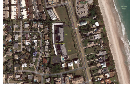
Built in 1981 - 44 units - 4 floors

Number of units: 44 Number of active listings for rent: 1 Number of active listings for sale: 3 Building inventory for sale: 6% Number of sales over the last 12 months: 1 Number of sales over the last 6 months: 1 Number of sales over the last 3 months: 0 Indialantic One Condo Association Address: 601 N Miramar Ave # 101, Indialantic, FL 32903, Phone: +1 321-725-8882 https://