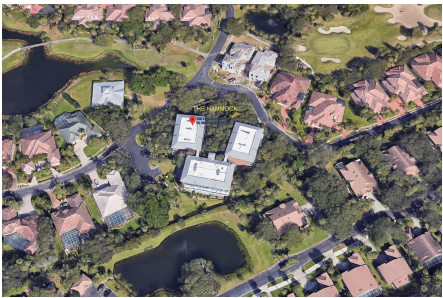
Built in 1986 - 27 units - 3 floors