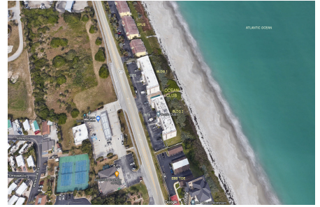
Built in 1982 - 24 units - 3 floors

Number of units: 24 Number of active listings for rent: 0 Number of active listings for sale: 0 Building inventory for sale: Number of sales over the last 12 months: 0% Number of sales over the last 6 months: 0 Number of sales over the last 3 months: 0 Ocean Club Address: 2981 S Hwy A1A, Melbourne Beach, FL 32951 https://