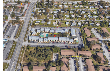
Built in 1978 - 84 units - 2 floors