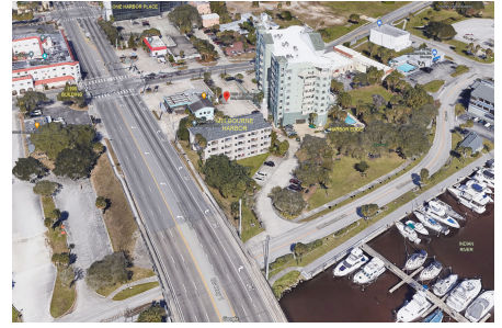
Built in 1984 - 20 units - 4 floors