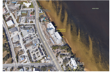
Built in 2021 - 68 units - 10 floors