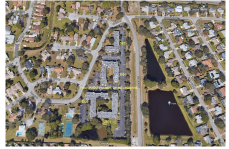
Built in 1981/1985 - 92 units - 2 floors

Pinewood Village of Melbourne HOA Address: 1713 Thrush Dr, Melbourne, FL 32935 Phone: +1 321-213-2232 http://www.pinewoodvillagehoa.com/home.html