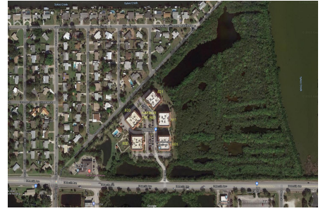
Built in 2004 - 94 units - 6 floors

Number of units: 94 Number of active listings for rent: 3 Number of active listings for sale: 5 Building inventory for sale: 5% Number of sales over the last 12 months: 3 Number of sales over the last 6 months: 2 Number of sales over the last 3 months: 0 Harbor Del Rio Condominium Association BP Davis Management (321) 784-2091 bpdavis@bpdavis.com https://www.hdrmifl.com/