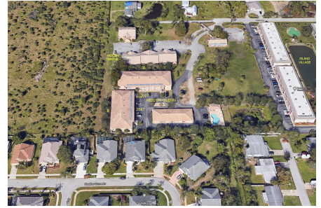
Built in 2007 - 22 units - 2 floors