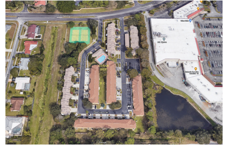
Built in 1984/2006 - 59 units - 2 floors