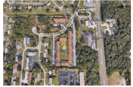
Built in 1983 - 88 units - 2 floors

Number of units: 88 Number of active listings for rent: 4 Number of active listings for sale: 2 Building inventory for sale: 2% Number of sales over the last 12 months: 3 Number of sales over the last 6 months: 3 Number of sales over the last 3 months: 3 The Palms Condominium Association, INC. of Palm Bay Address: 2100 Forest Knoll Dr NE, Palm Bay, FL 32905 https://www.palmscondo.com/