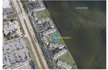
Built in 1986 - 72 units - 2 floors

Number of units: 72 Number of active listings for rent: 0 Number of active listings for sale: 2 Building inventory for sale: 2% Number of sales over the last 12 months: 4 Number of sales over the last 6 months: 3 Number of sales over the last 3 months: 3 Sunrise Landing Condominium Association Address 7350 N Highway 1 Cocoa, Florida 32927 Phone +1 321-639-3360 https://