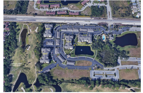
Built in 2007 - 160 units - 4 floors

Number of units: 160 Number of active listings for rent: 0 Number of active listings for sale: 6 Building inventory for sale: 3% Number of sales over the last 12 months: 3 Number of sales over the last 6 months: 3 Number of sales over the last 3 months: 2 Ventura at Turtle Creek Address: 3802 Alafaya Ln, Rockledge, FL 32955 Phone: +1 833-772-0493 https://venturaturtlecreek.com/