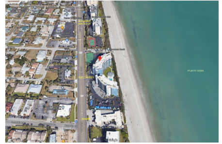
Built in 1973 - 78 units - 8 floors