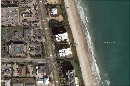
Built in 2005 - 24 units - 7 floors