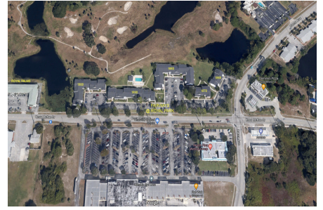
Built in 1981 - 96 units - 2 floors