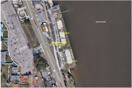
Built in 2022 - 50 units - 6 floors