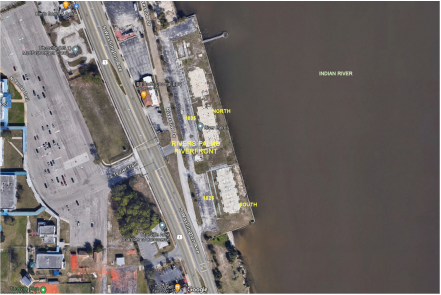
Built in 2022 - 50 units - 6 floors