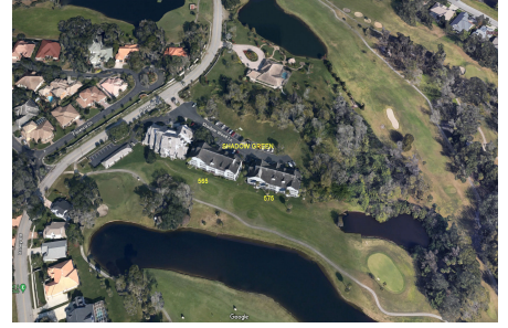
Built in 1990 - 30 units - 3 floors