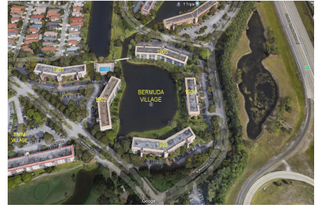
Built in 1985/1986 - 224 units - 4 floors