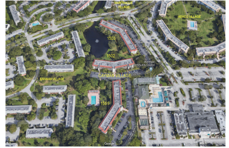
Built in 1987/1988 - 144 units - 4 floors