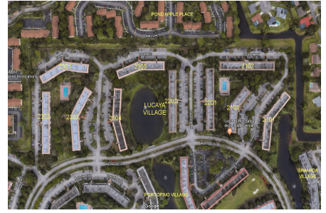
Built in 1980/1981 - 544 units - 4 floors