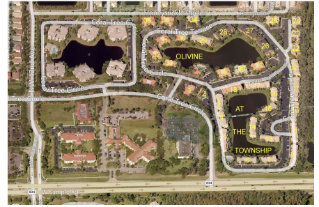
Built in 1995/2006 - 372 units - 2 floors

Number of units: 372 Number of active listings for rent: 1 Number of active listings for sale: 1 Building inventory for sale: 0% Number of sales over the last 12 months: 0 Number of sales over the last 6 months: 0 Number of sales over the last 3 months: 0