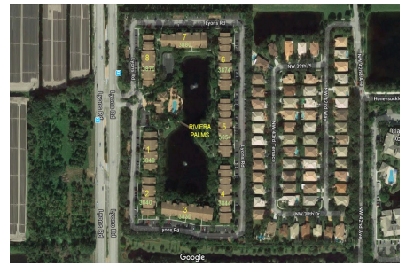
Built in 2001 - 248 units - 3 floors