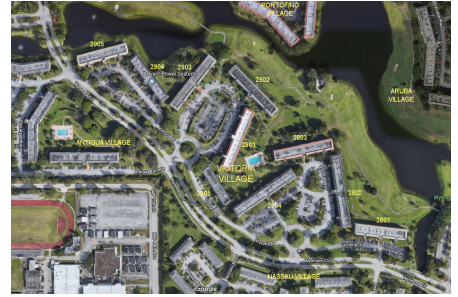
Built in 1978/1979 - 472 units - 4 floors