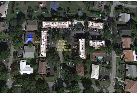
Built in 2005 - 50 units - 2 floors