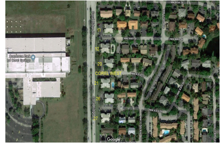
Built in 2006 - 48 units - 2 floors