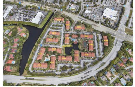
Built in 1991 - 384 units - 3 floors

Number of units: 384 Number of active listings for rent: 4 Number of active listings for sale: 13 Building inventory for sale: 3% Number of sales over the last 12 months: 7 Number of sales over the last 6 months: 3 Number of sales over the last 3 months: 0 Visconti Condominium Address: 9000 W Atlantic Blvd, Coral Springs, FL 33071 Phone: +1 (954) 796-8888 https://