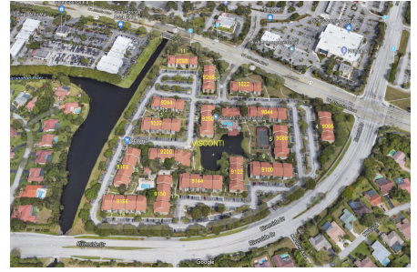
Built in 1991 - 384 units - 3 floors

Visconti Condominium Address: 9000 W Atlantic Blvd, Coral Springs, FL 33071 Phone: +1 (954) 796-8888