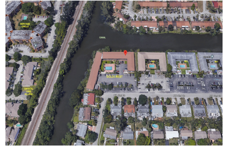
Built in 2007 - 40 units - 2 floors