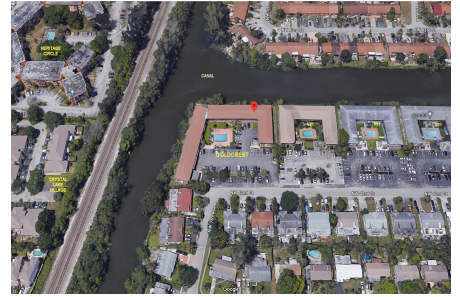
Built in 2007 - 40 units - 2 floors