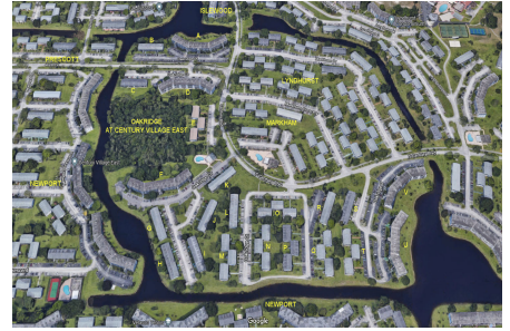
Built in 1974/1978 - 688 units - 4 floors