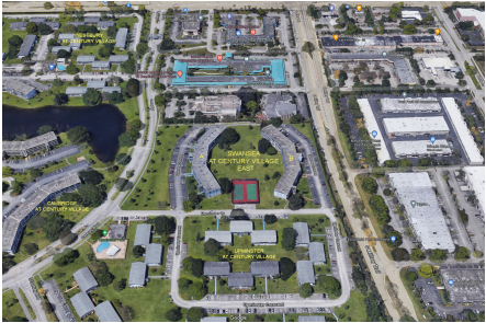
Built in 1978 - 144 units - 4 floors