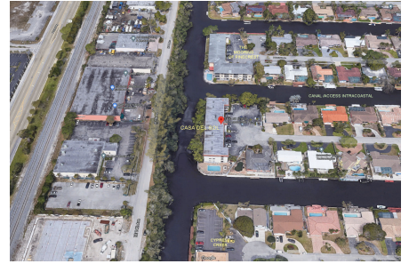
Built in 1983 - 23 units - 3 floors