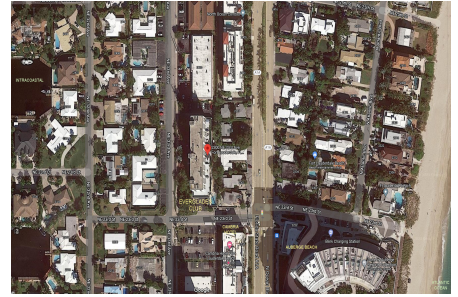
Built in 1986 - 44 units - 9 floors

Number of units: 44 Number of active listings for rent: 2 Number of active listings for sale: 1 Building inventory for sale: 2% Number of sales over the last 12 months: 3 Number of sales over the last 6 months: 2 Number of sales over the last 3 months: 1 Everglades Club Condominium Address: 2300 NE 33rd Ave, Fort Lauderdale, FL 33305 (954) 563-5016 https://