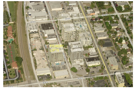
Built in 2008 - 36 units - 7 floors