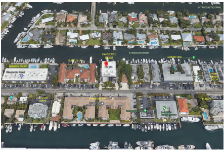
Built in 2022 - 10 units - 5 floors

Number of units: 10 Number of active listings for rent: 0 Number of active listings for sale: 2 Building inventory for sale: 20% Number of sales over the last 12 months: 0 Number of sales over the last 6 months: 0 Number of sales over the last 3 months: 0 Harbor's Edge Address: 1507 SE 15th St, Fort Lauderdale, FL 33316 Phone: +1 954-451-0014 https://