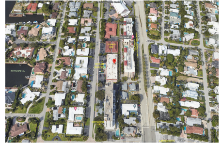
Built in 1984 - 24 units - 2 floors

Number of units: 24 Number of active listings for rent: 0 Number of active listings for sale: 2 Building inventory for sale: 8% Number of sales over the last 12 months: 2 Number of sales over the last 6 months: 1 Number of sales over the last 3 months: 0 Ocean Garden Condominium Association Inc 2400 Ne 33rd Ave Fort Lauderdale, FL 33305-1887 https://