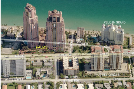
Built in 2000 - 89 units - 30 floors