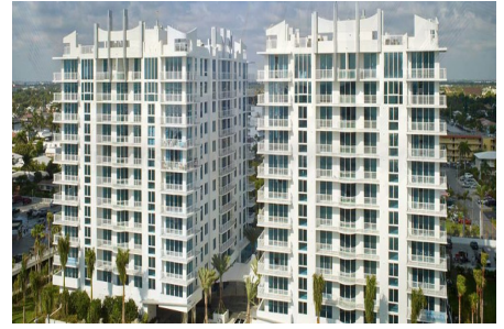
Built in 2009 - 86 units 12 floors

Number of units: 86 Number of active listings for rent: 0 Number of active listings for sale: 2 Building inventory for sale: 2% Number of sales over the last 12 months: 5 Number of sales over the last 6 months: 3 Number of sales over the last 3 months: 1 Sapphire Fort Lauderdale Condo Association (954) 537-1837 https://