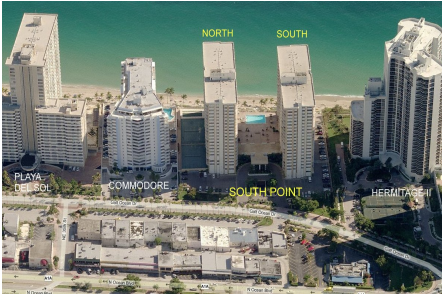
Built in 1975 - 199 units - 21 floors